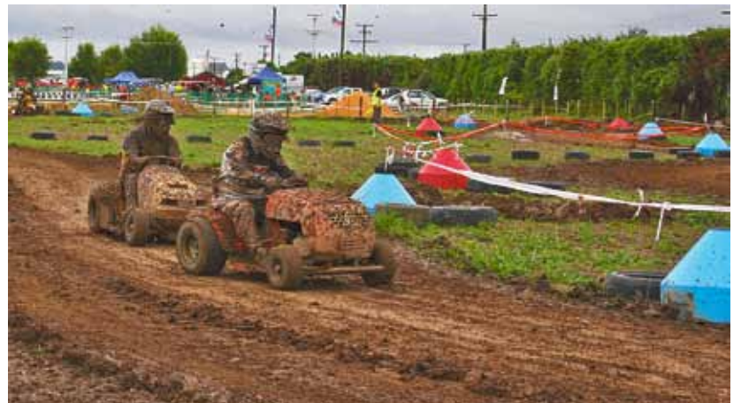
Competitors get down and dirty in the lawnmower racing.

Throughout the weekend there will also be demonstrations of chainsaw