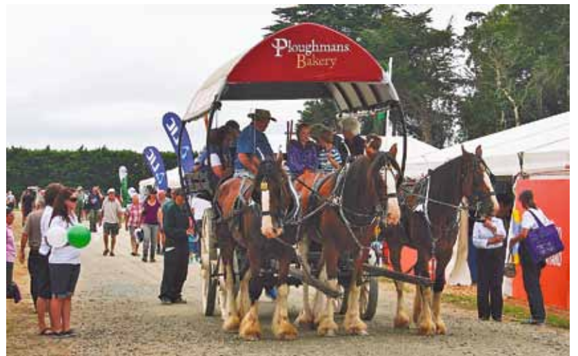
Clydesdale horse and cart rides are free for Field Days visitors.