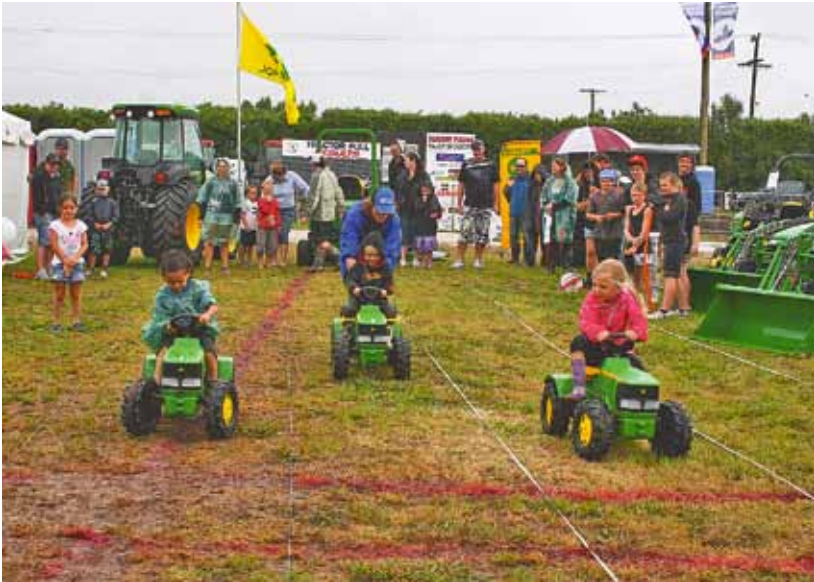
Junior tractor racing will back at this year's Northland Field Days.