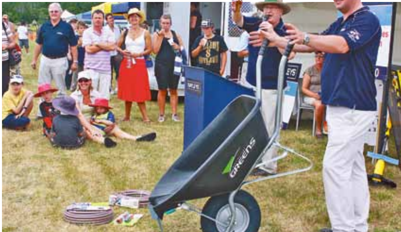
Proceeds from the Bayleys auction will go towards guide dog training.