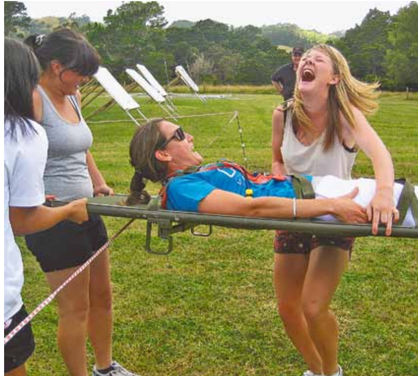
A number of brave volunteers are needed for the Warkworth & Districts A&P Show military art competition on January 28.

“While stretcher racing is a lot of fun, it is also very hard work. When the whistle blows people who have never entered a stretcher race before suddenly discover how heavy a person lying on a stretcher can be. A coordinated effort from the whole team is required to complete the 100m dash which has