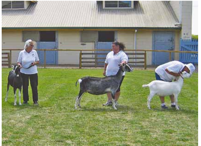
The short line-up in the 2009 breed show, from left, British Alpine, Sable and Saanen.