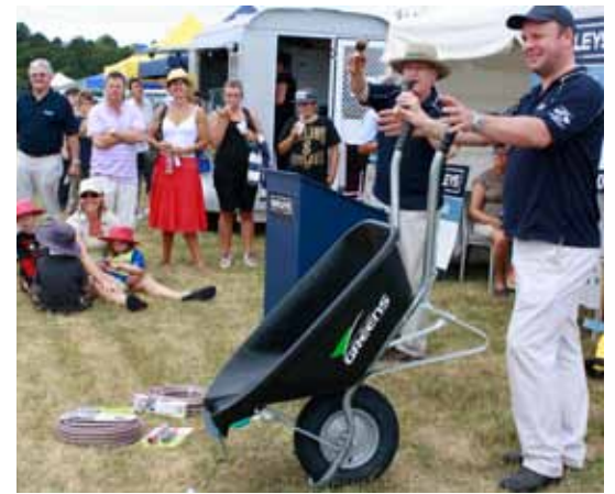
Last year's auction was a crowd-pleaser and raised $6000.