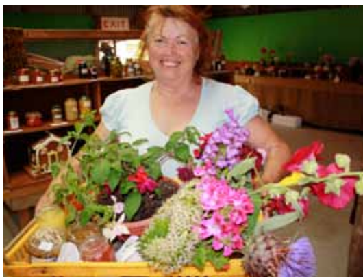
The show is a great place to check out what other people are harvesting from their gardens.