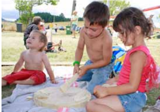
Lots of the activities, particularly those for children, are on offer at the show for free.

The crowds seem to come in two waves – the early birds and then those that come after the markets have closed.