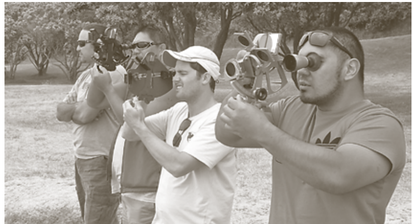
Mahurangi Technical Institute students find their latitude using noon sun sight at Anchor Bay during the ocean navigation course.