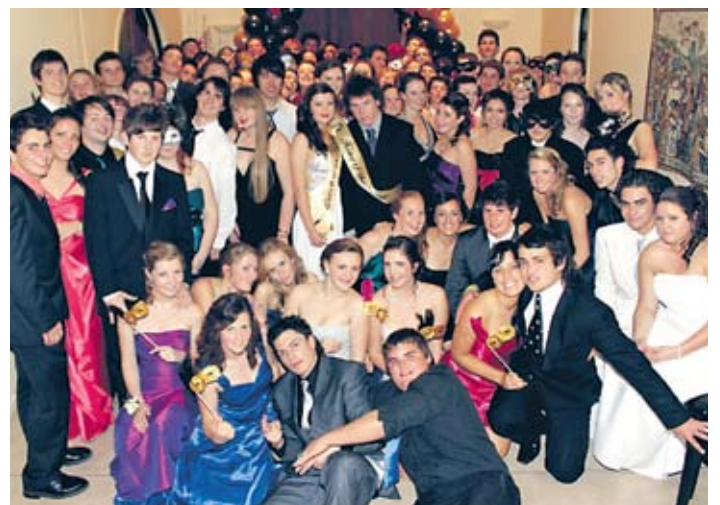
For most senior students, the school ball is the social highlight of their final years at college.