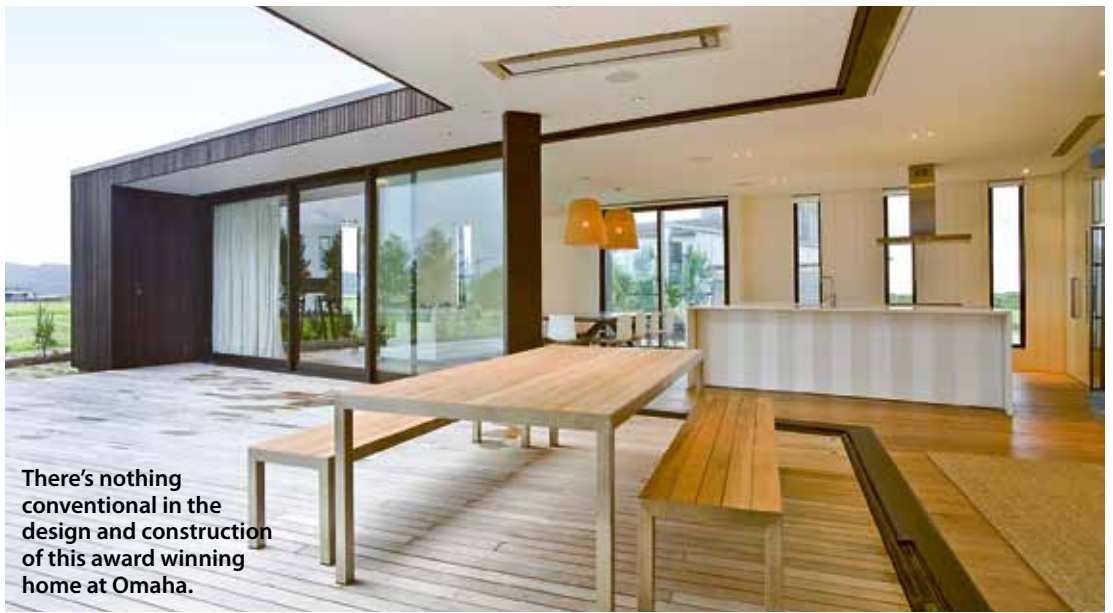
There's nothing conventional in the design and construction of this award winning home at Omaha.