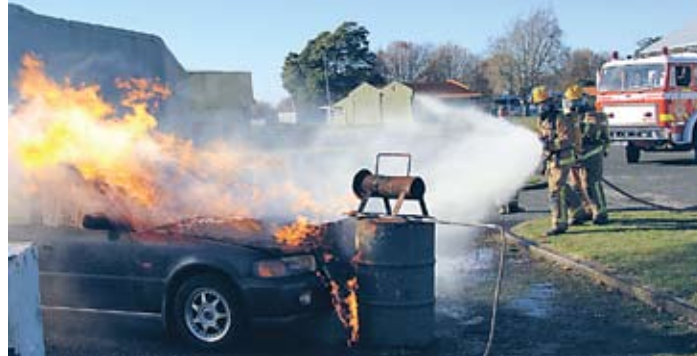
Firefighters at a recent Station Officers Course, conducted by the NZ Fire Service for our rural fire officers, are put through their paces. The course was based around incident management and command and control at incidents.