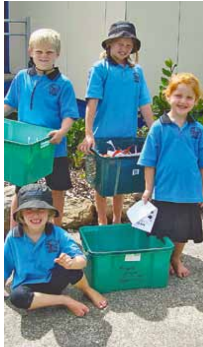
Mangawhai Beach school students are successfully turning their waste paper into school landscaping.

Earning trees highlights the importance of replacing used resources and provides a practical focus for teaching recycling and environmental issues, she says. Once planted, trees provide shade, become carbon sinks and attract native birds.