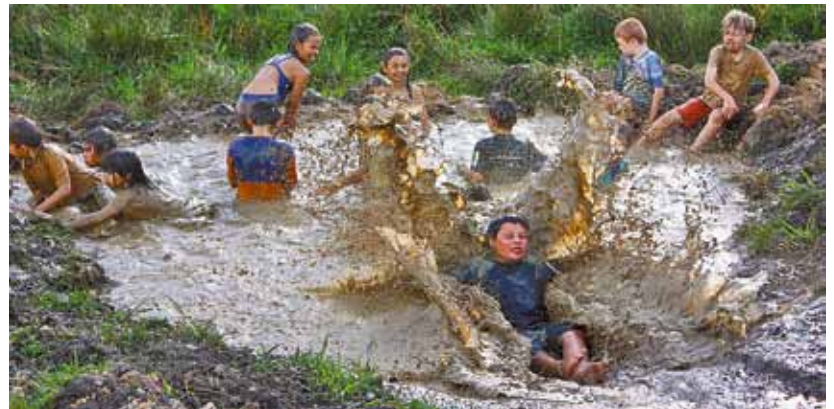
Members of the Warkworth Scout Group relished the chance to get wet and muddy as part of the Scouts National Mud Slide Day in February.