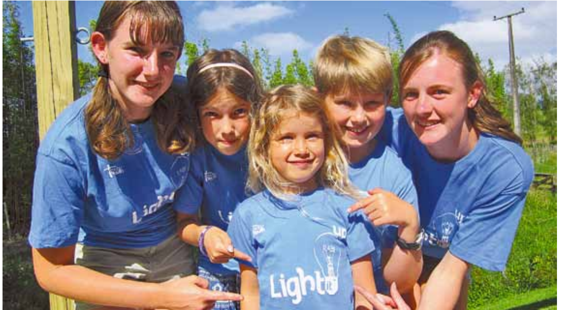
A dinner and auction evening with live music will be held at the Puhoi Hall on April 27 to help raise funds for the Mahurangi Presbyterian Youth Group solar light project on Rabi Island.