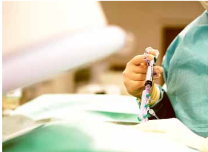
A growing number of day-case conditions are being treated at the centre.

"We are providing a comprehensive service for plastics with very positive feedback. Patients are advised to consult with their general practitioner